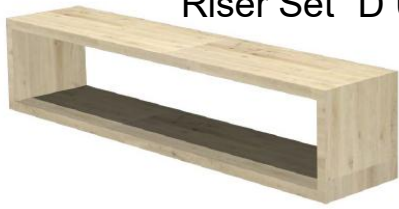
Riser Set "D Unit"