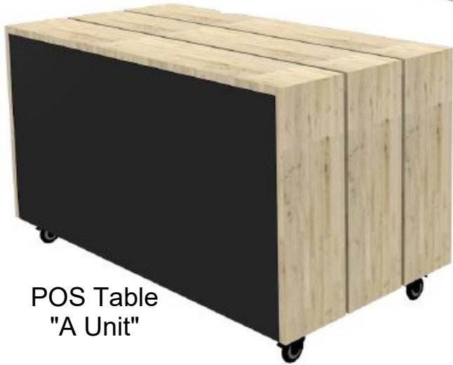
POS Table "A Unit"