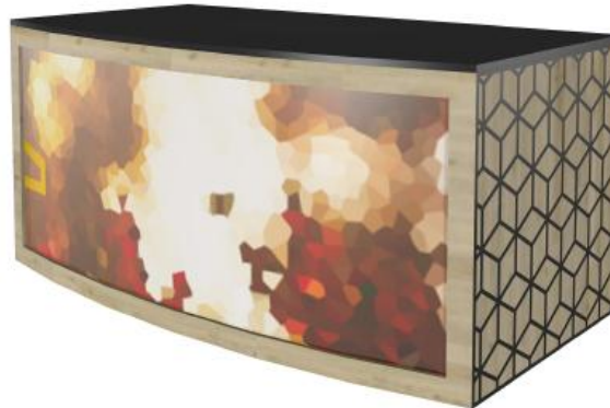
Customer Service Counter "E Unit"