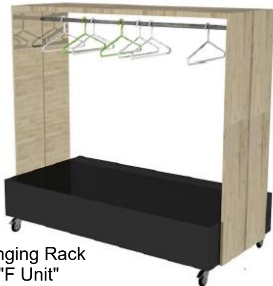
Hanging Rack "F Unit"