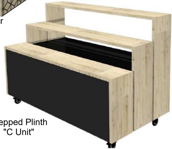
Stepped Plinth "C Unit"